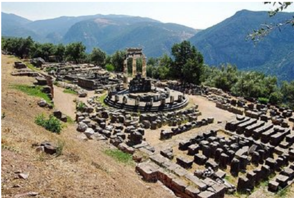
“On the High Hills in the Groves” on Mt. Parnassus in Greece

Below is a picture of Delphi on Mount Parnassus in Greece – a well-known site of pagan worship, and possibly human sacrifice.