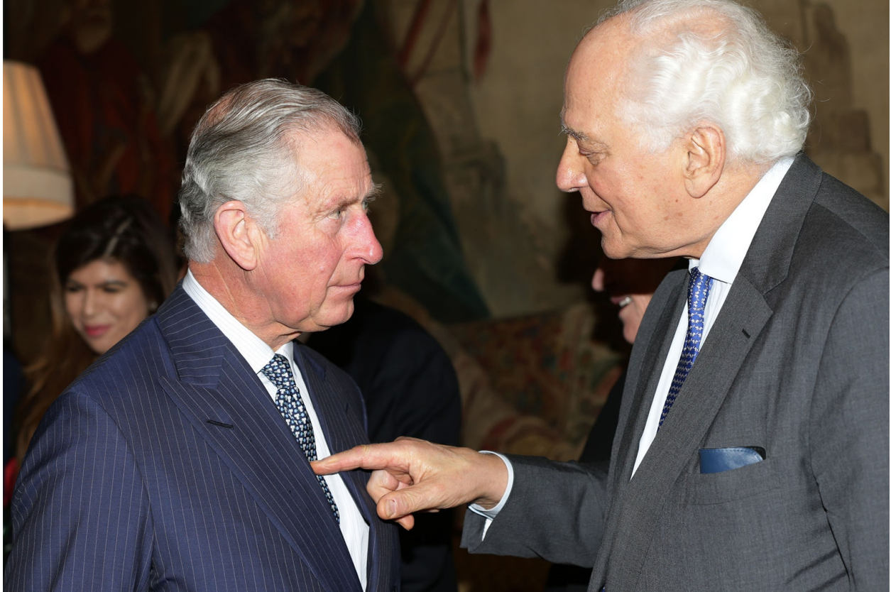
King Chuckie (Jew) being given orders by Evelyn de Rothschild (Jew)