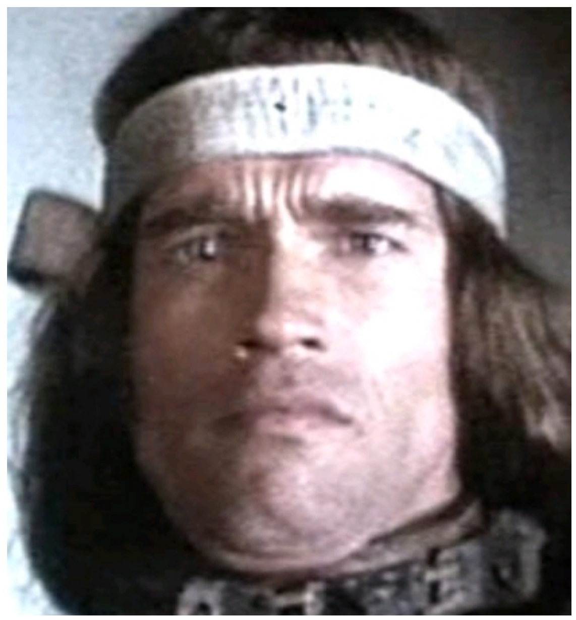
Conan the Barbarian Reptile eyes (slits)