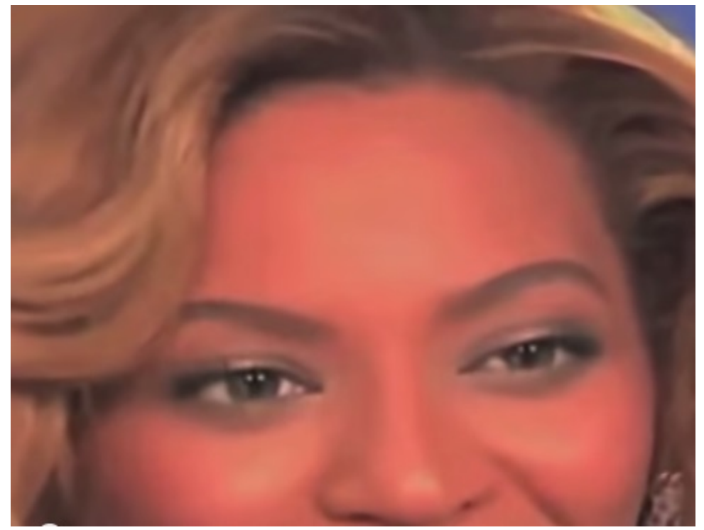
[vid] BEYONCE DEMONIC EYES EXPOSED HD!